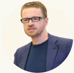
Morgan McSweeney Chief of Staff

Morgan McSweeney is the most senior appointee in No.10, overseeing and managing Downing Street political staff and the work of Special Advisers across government.