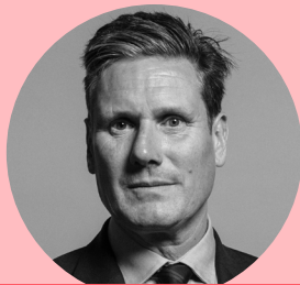
Sir Keir Starmer KC MP Prime Minister